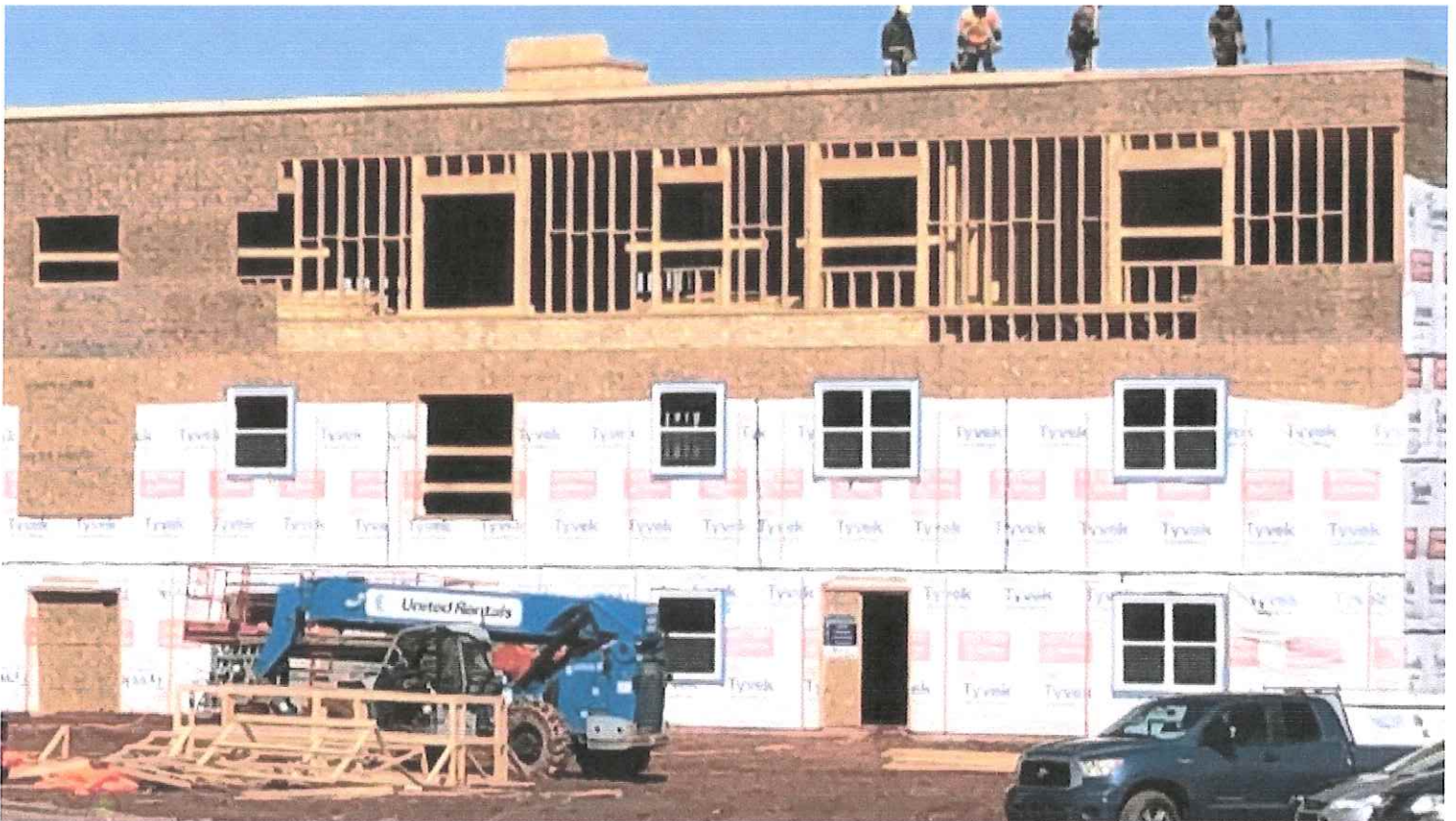
Permits for apartment construction are up almost 100 per cent since 2017.

Kevin Yarr · CBC News · Posted: Jun 13, 2019 2:00 PM AT | Last Updated: June 13